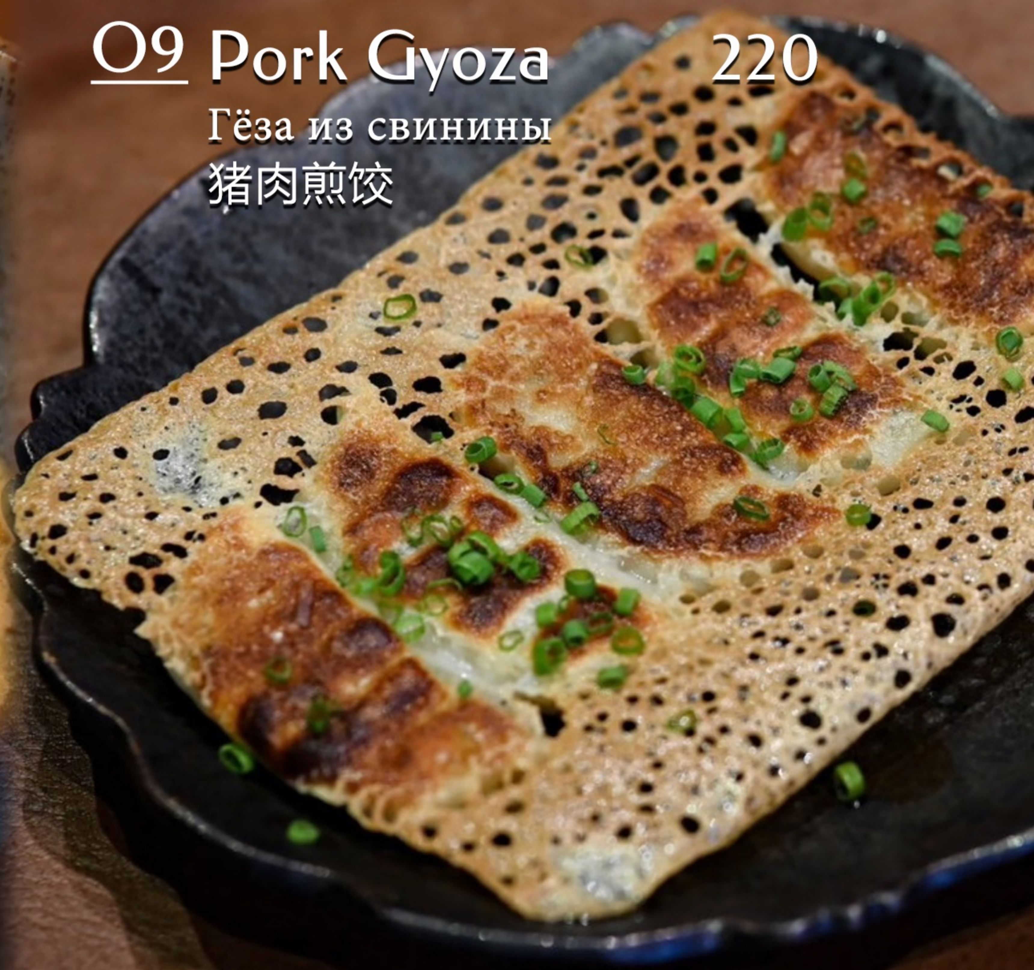
O9 Pork Gyoza 220 Гёза из свинины 猪肉煎饺