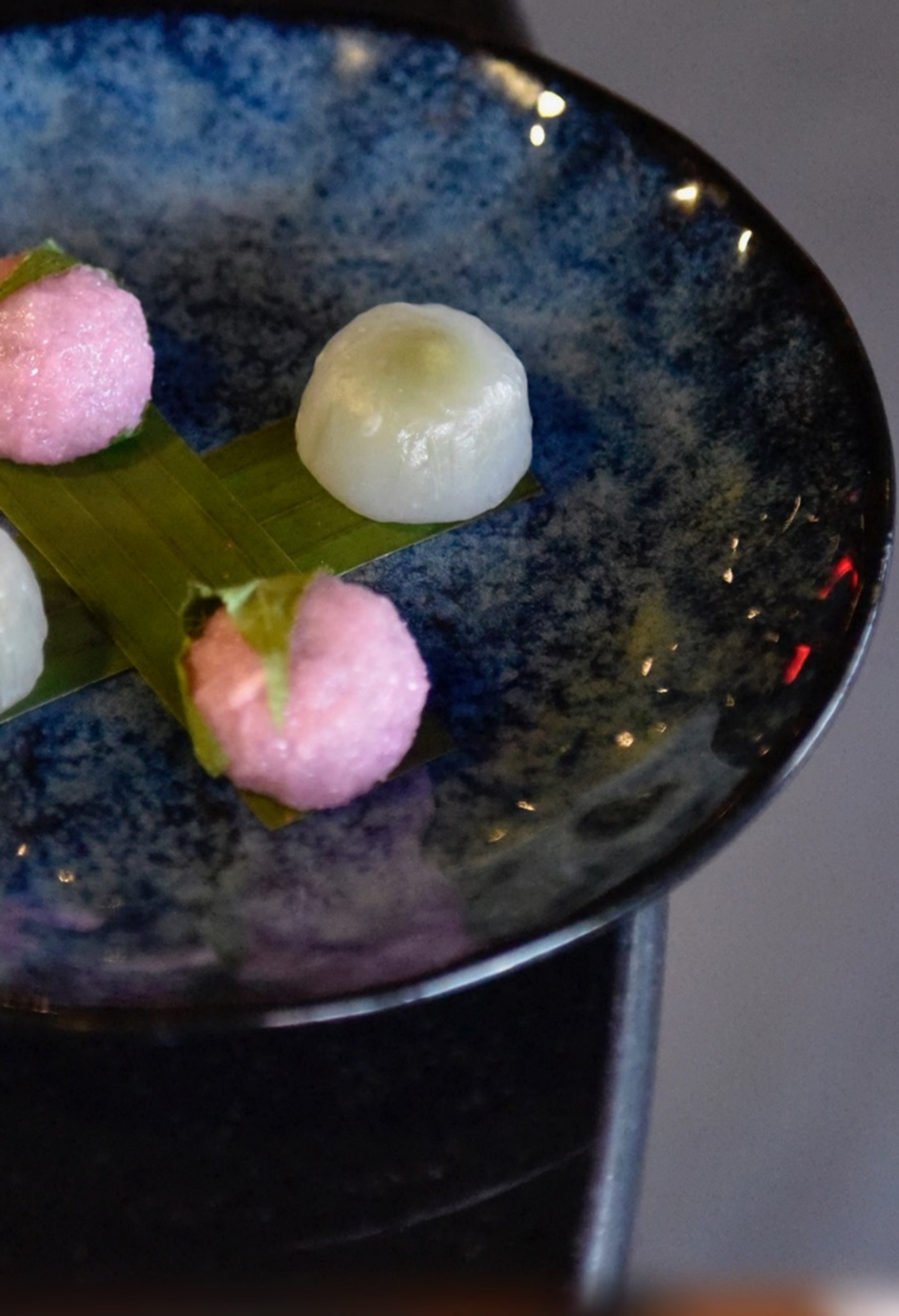
D1 Sakura & Matcha Mochi 200 Сакура матча моти 樱花抹茶麻薯