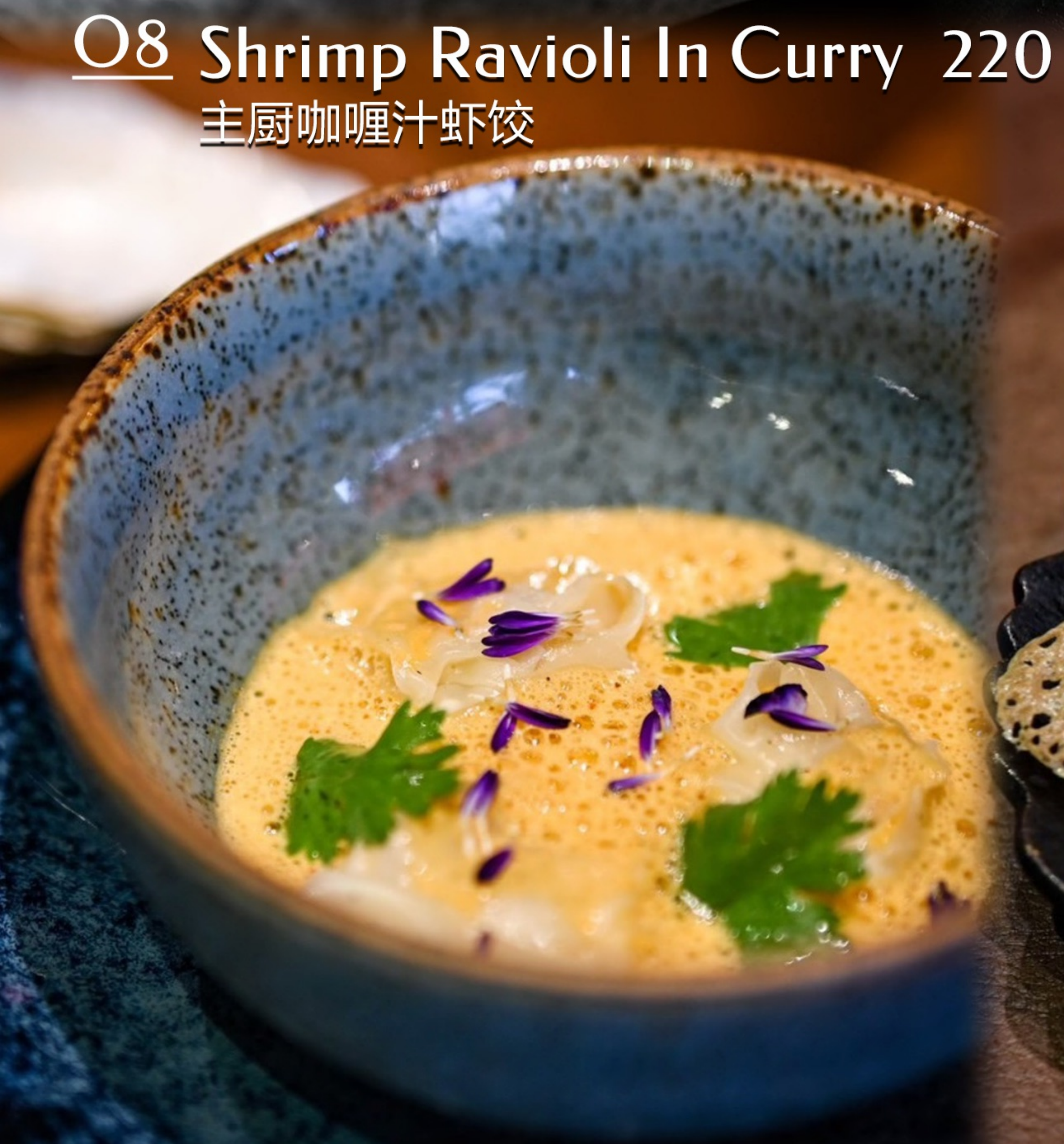
O8 Shrimp Ravioli In Curry 220 主厨咖喱汁虾饺