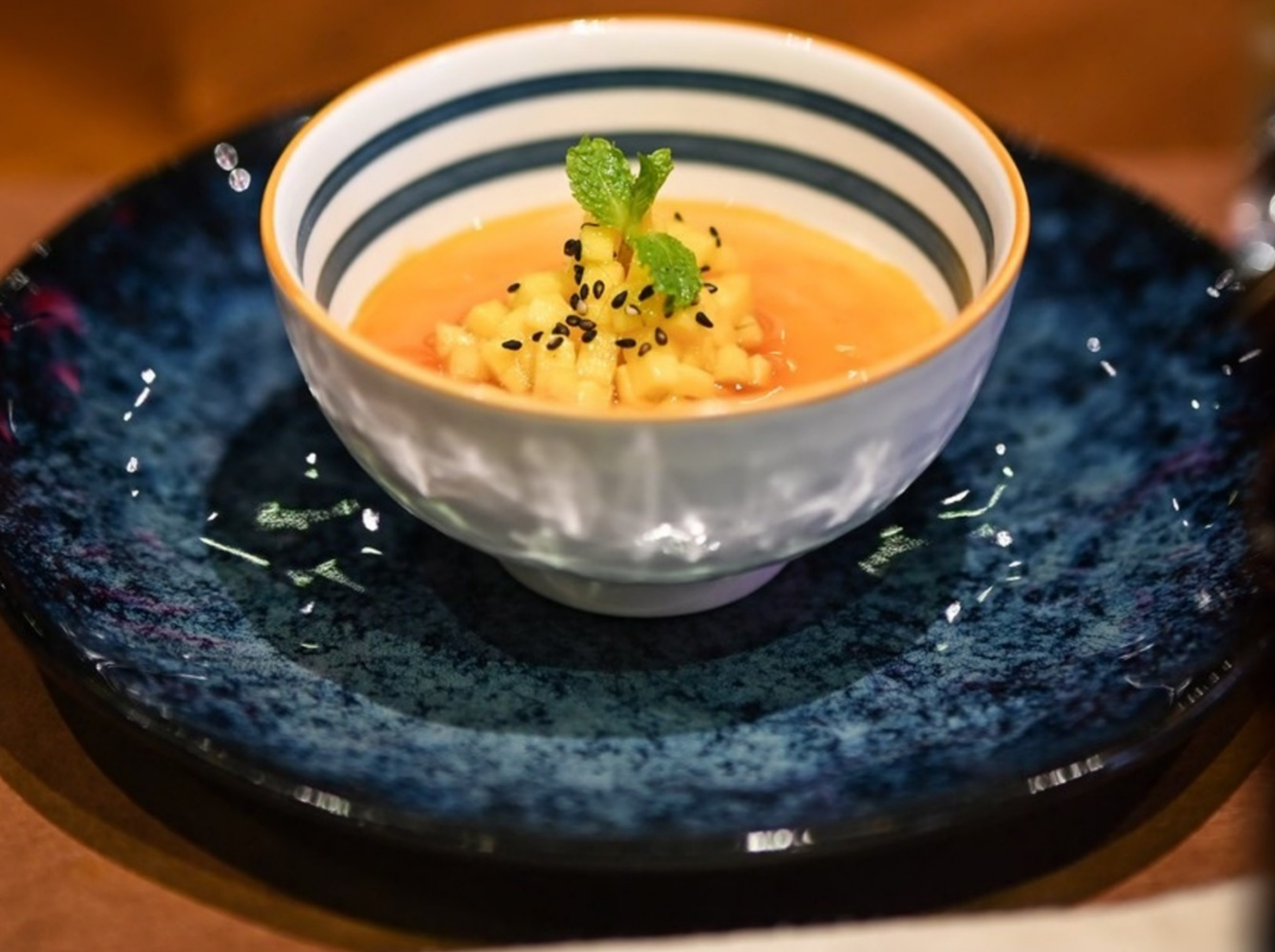
D2 Coconut & Mango Panna Cotta 250 椰子芒果意式奶冻