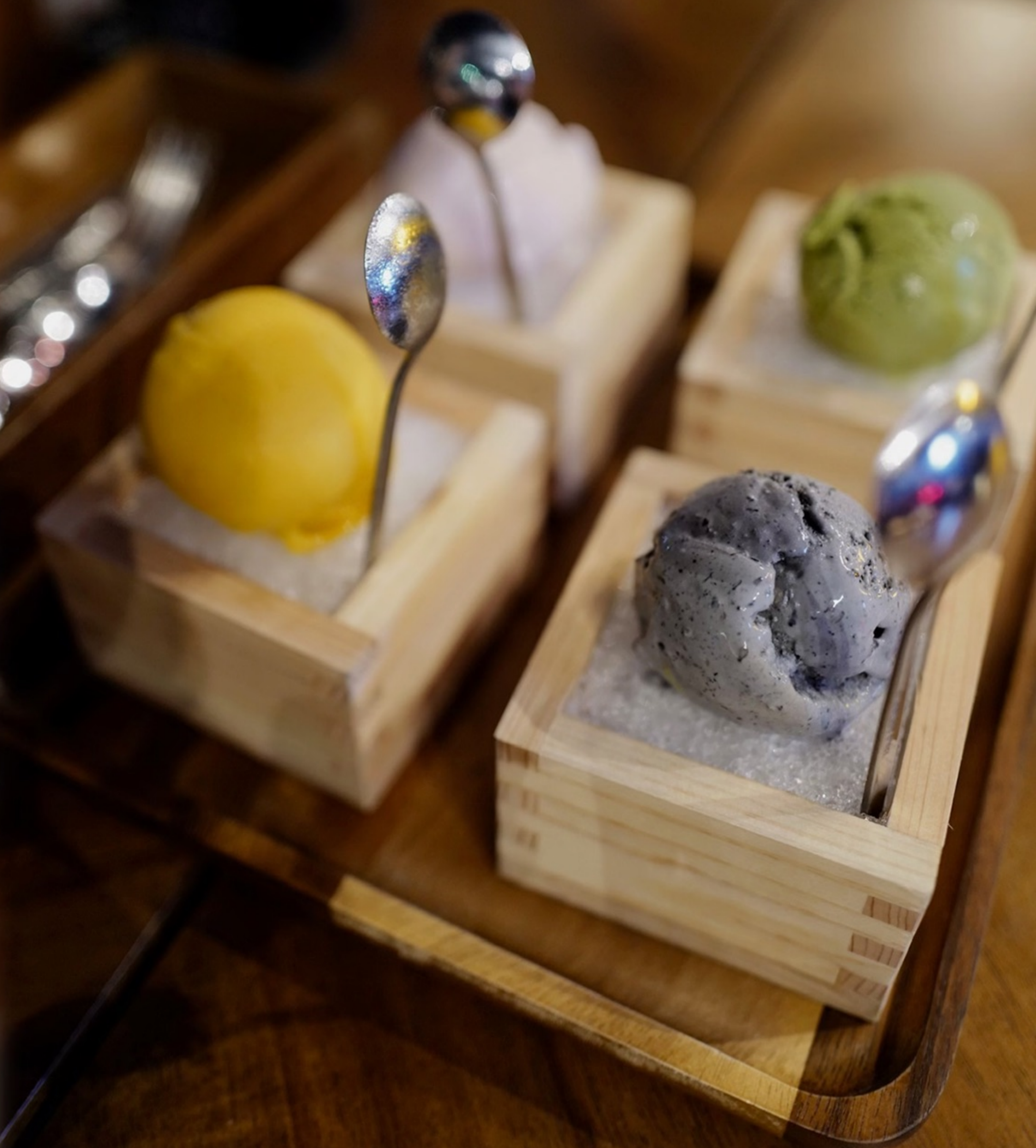
D5 Gelato 100 Джелато 冰淇淋