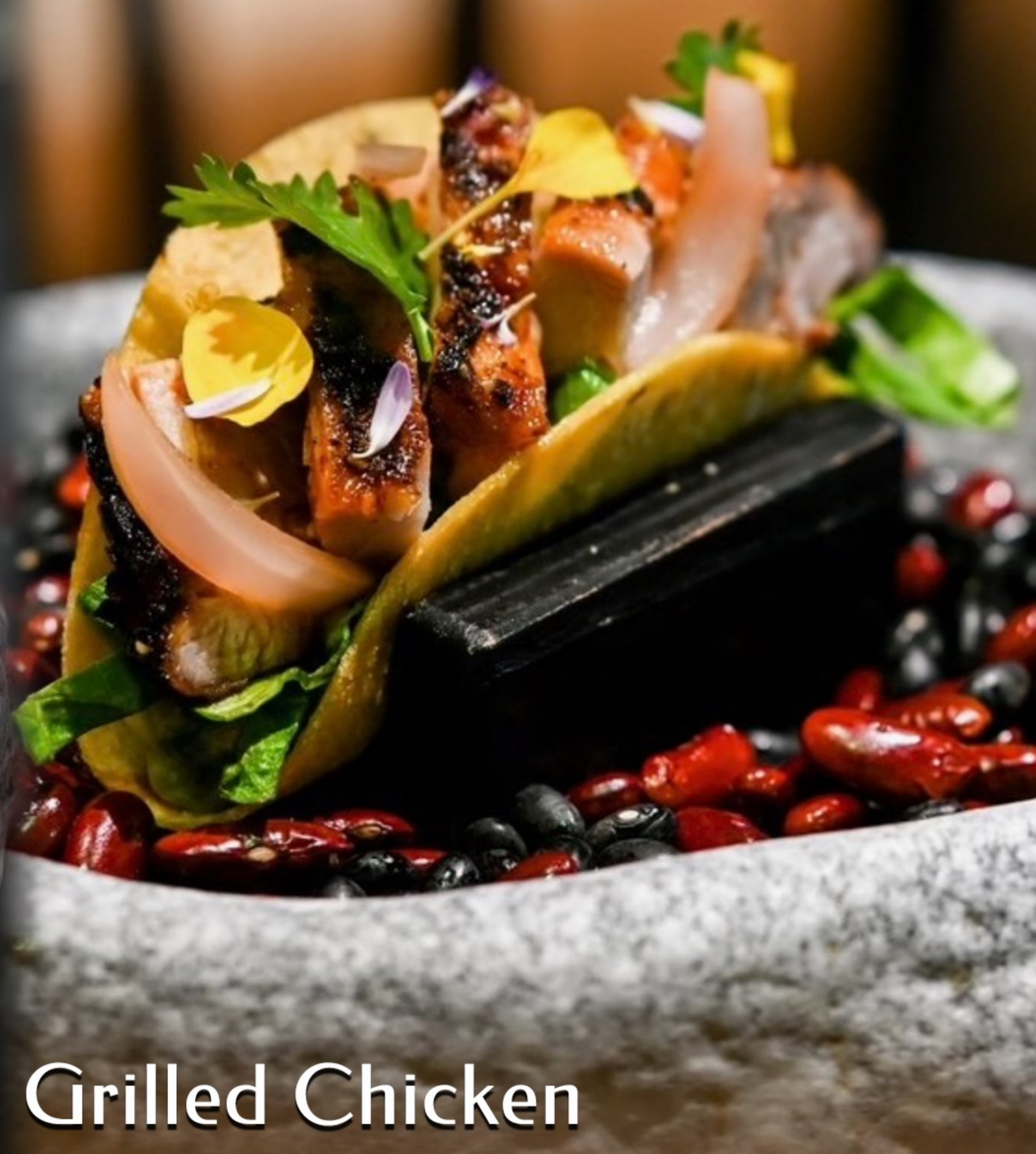
O7 Grilled Chicken & Avocado Taco 180/pc 鸡肉鳄梨塔