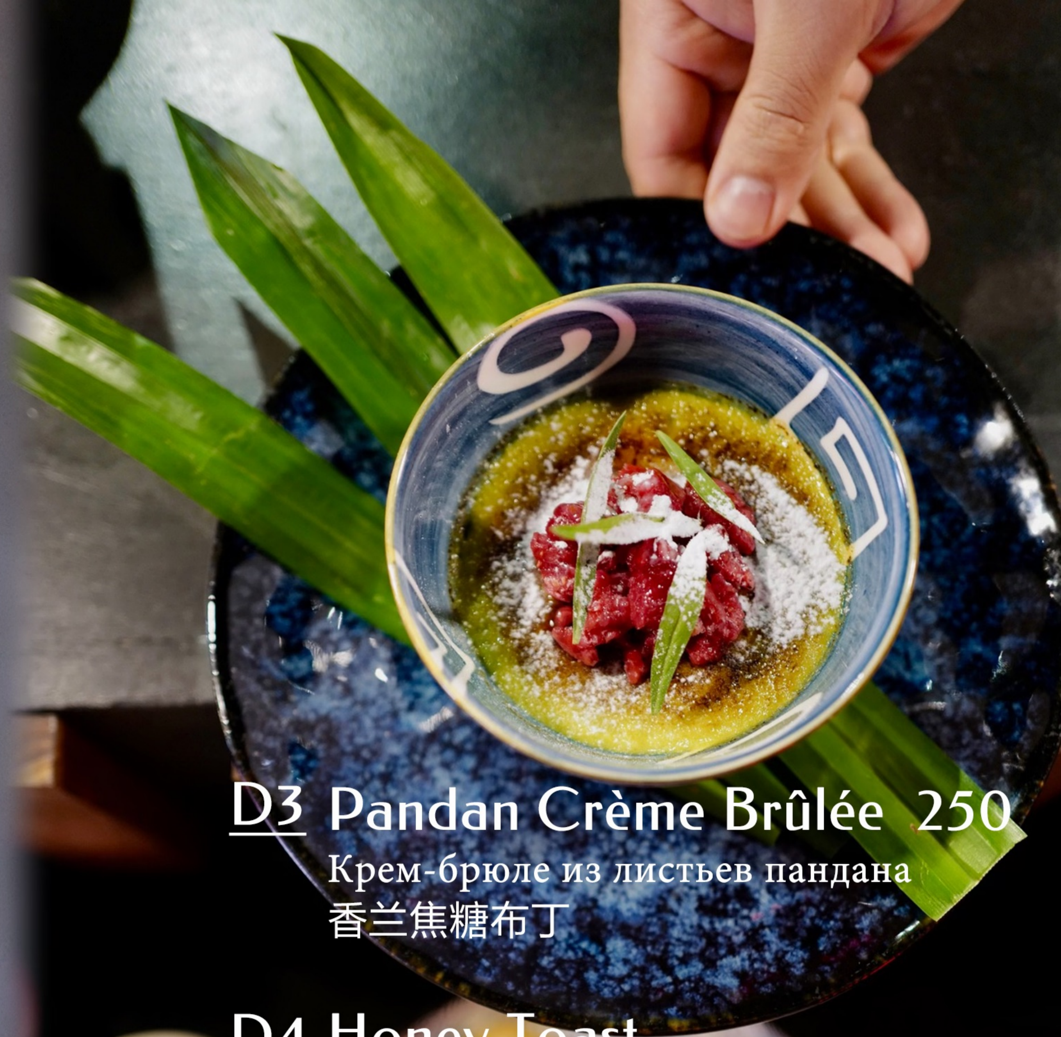
D3 Pandan Crème Brûlée 250 Крем-брюле из листьев пандана 香兰焦糖布丁