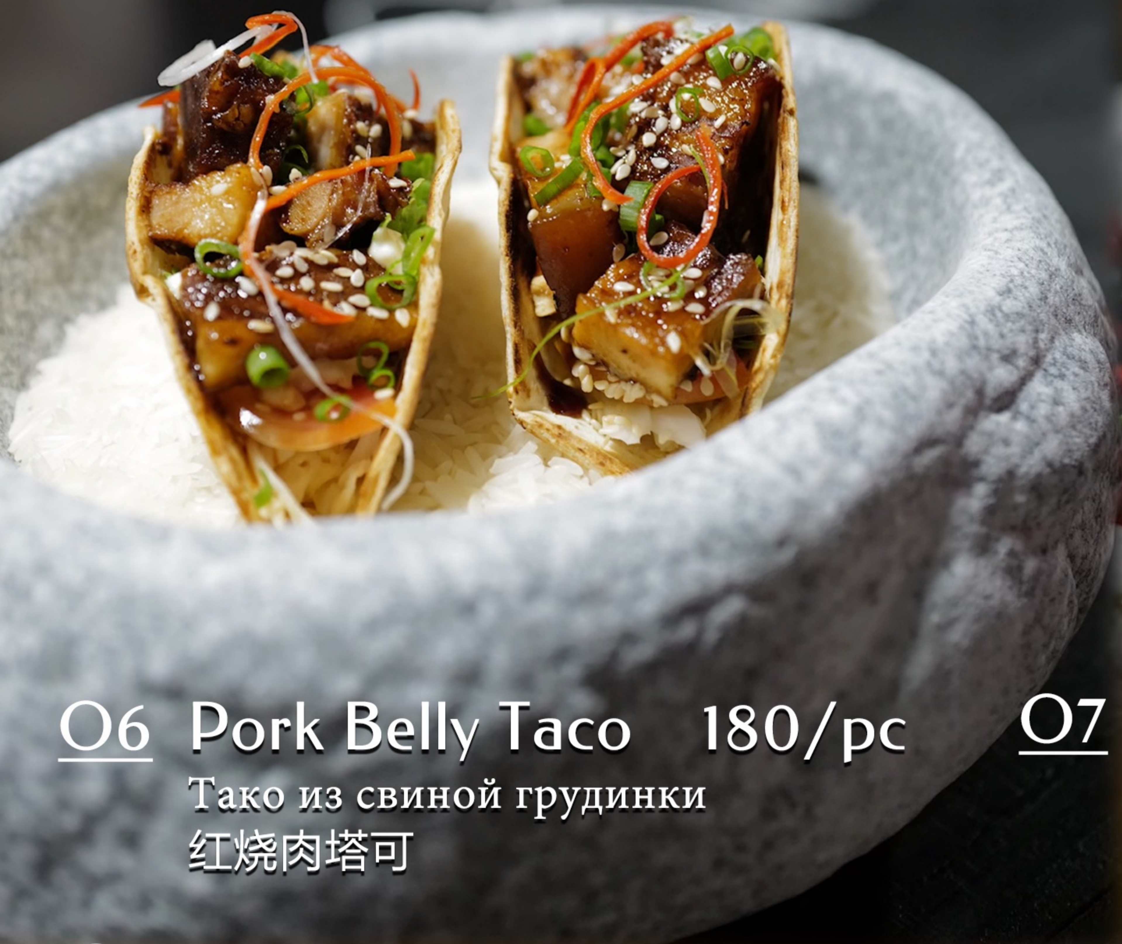
O6 Pork Belly Taco 180/pc Тако из свиной грудинки 红烧肉塔可